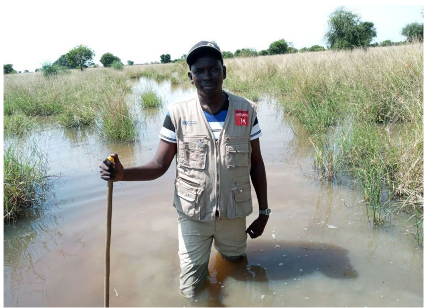
Wading through flooded land to access hard to reach communities